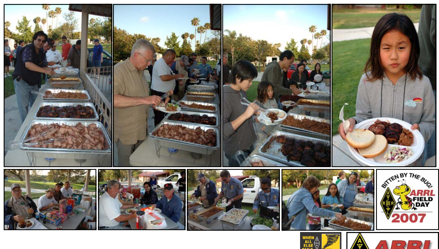
There is always plenty of food at the Field Day BBQ!