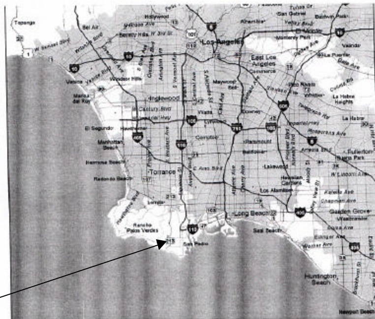
Location of FD 2000

Come early to help set-up or stay late to tear-down