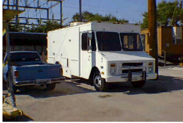
"Out with the old"