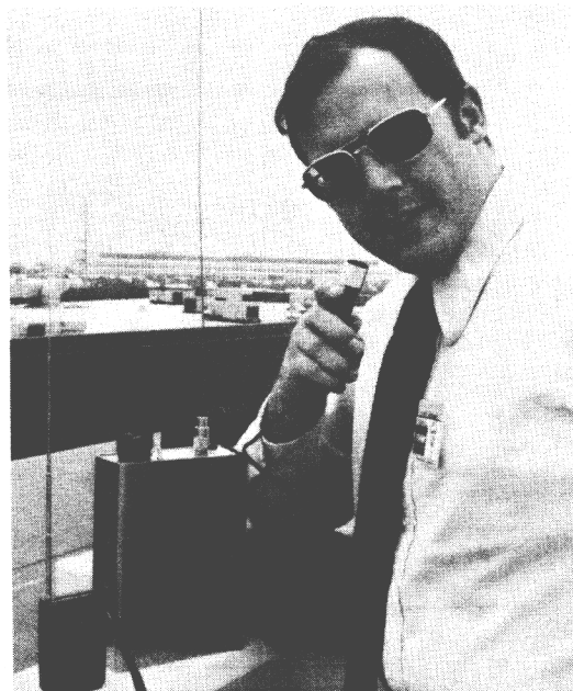
The author with 2 Meter Portable